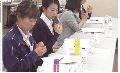
Female staff on the development team