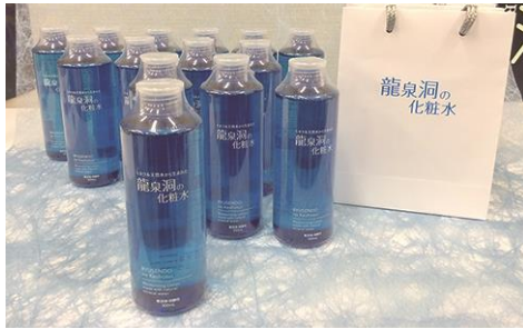
The unique blue bottle portraying Iwaizumi's blue waters