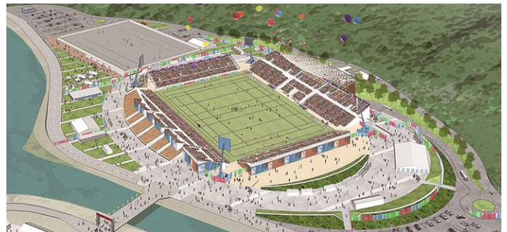
A mock-up of the Kamaishi Unosumai Recovery Stadium (name TBC)