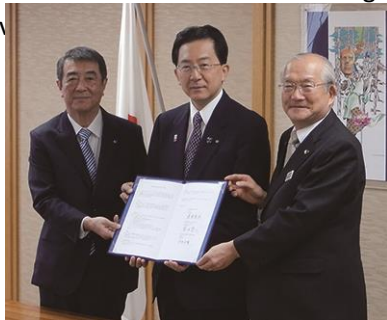
The signees. Left: Director Fukuda, Taiheiyo Cement. Centre: Governor Tasso, Iwate. Right: Mayor Toda, Ofunato.

The agreement contains 4 measures: reducing environmental damage, processing disaster debris, promoting environmental education, and protecting the environment while revitalizing the region.