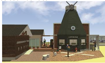
A mock-up of the new station building

It is estimated that the full Sanriku Railway line, from Kuji to Sakari (Ofunato), will commence operation by the end of the 2018 financial year, providing a huge boost to passenger numbers and the revitalization of the area.