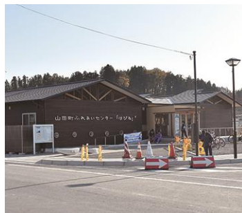
Hapine, the community center next door