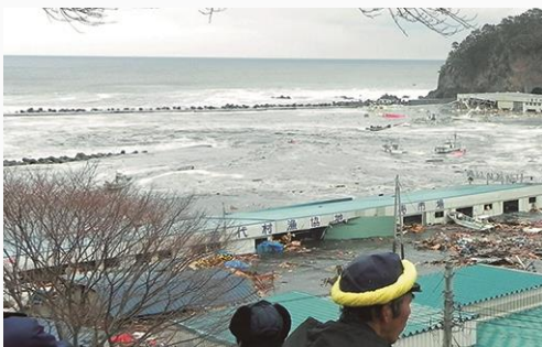
The tsunami in the Fudai Harbour.

What happened that day? In this section, we will be looking back at the disaster in each coastal town.