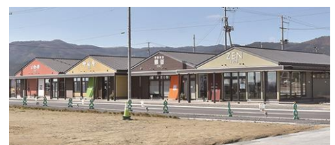
Rikuzentakata Machinaka Terrace

The facility is a multipurpose space with kitchen facilities and large tables, for hosting cooking lessons and other workshops. Unless it's reserved for an event, people can freely use the facilities to rest, read, and eat. It's expected to become a hub for people from all generations.