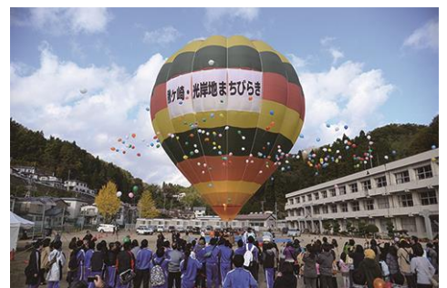
Hot air balloon rides