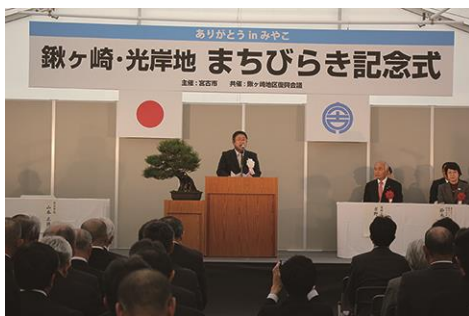
The town opening ceremony

Additionally, at Kuwagasaki Elementary School, there was an event where you could view the reconstruction's progress from the sky, by hot air balloon. At a special event space, a large group of residents gathered to watch a powerful performance from the Yamaguchi Taiko drum group, and enjoy minced Pacific saury soup.