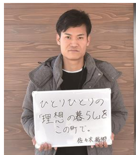
Realizing everyone's individual "ideal lives", right here in Rikuzentakata.

He is currently in charge of "vacant house ventures" at a community development charity called "Takata Kurashisha".