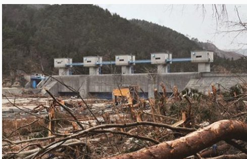
The flood gate, which minimized damage

The Otanabe Seawall also provided successful protection. The 14m-high tsunami was completely blocked, so there was no damage at all to homes on its inland side.