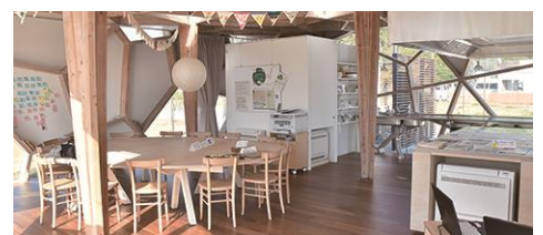
Inside Honmaru House