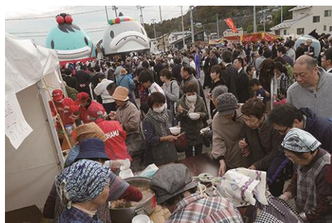
The town opening event