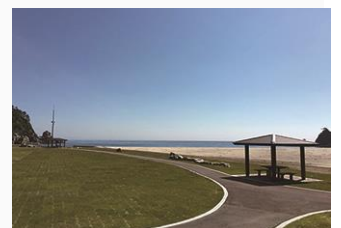
A recently-built coastal park