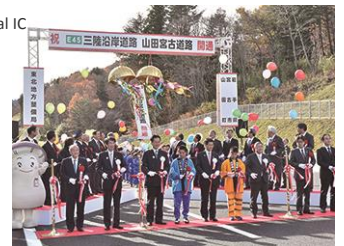
The opening ceremony