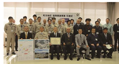
A commemorative picture of the ceremony