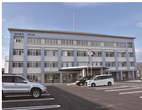
The newly-constructed Miyako Police Station

Until Kamaishi Police Station is fully re-established, the unit will use Miyako Police station as a base, from which to patrol the coastal region.