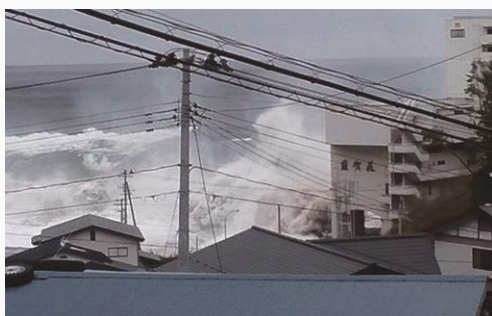
The tsunami floods the Ragaso Hotel

What happened that day? In this section, we will be looking back at the disaster in each coastal town.