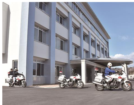
The traffic police's base at Miyako Police Station