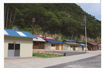
The reconstructed fishing huts

should be passed on to future generations. The huts were rebuilt in December 2014 as part of the national reconstruction program.