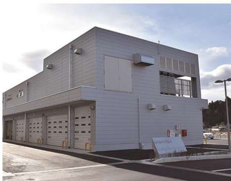
The adjacent garage