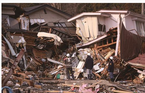
The destroyed village center