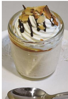
Left: Students meet Kamaishi's Mayor Right: The new Kasshigaki Parfait