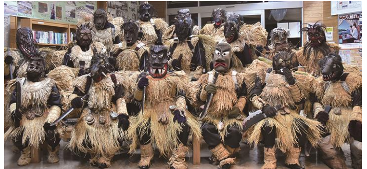
Suneka gather to visit homes

The name Suneka may have originated from the term "sunekawataguri" which points to the act of scraping off burn spots made on the "sune (shin)" on lazy people who do nothing but lay near the warmth of the hearth during winter. There are 10 other similar Raihoshin events around the country that are designated as important intangible cultural properties. They all aim to be registered as UNESCO Intangible Cultural Properties under the title, "Raihoshin: Deities in Masks and Disguises".