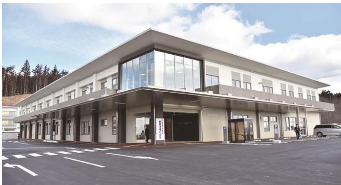
The reconstructed Iwate Prefectural Takata Hospital

With the completion of Takata Hospital, all three prefectural hospitals destroyed by the tsunami have now been restored.