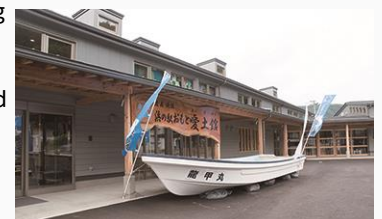
The Coastsides Stop - Omoto Aidokan opens in Omoto district