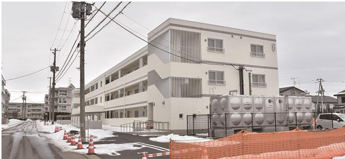
Building #8 of the 1st Bingo Apartment Complex

The prefecture plans to build 201 more inland housing units for disaster survivors, including 118 in Morioka, 34 in Kitakami, 14 in Oshu, and 35 in Kitakami. Local authorities will build 52 further homes; 30 in Hanamaki and 22 in Tono. Construction is due to be completed by the end of the 2019 financial year.