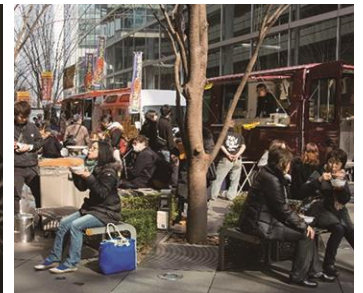
Forum visitors enjoy the local food of Tohoku