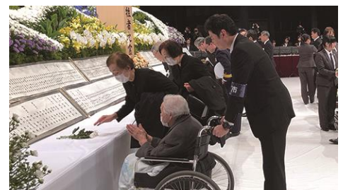
Flowers placed on the altar

We are accepting subscriptions for the Iwate Reconstruction Supporters Team Newsletter!