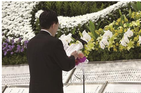
Governor Tasso gives his ceremonial address