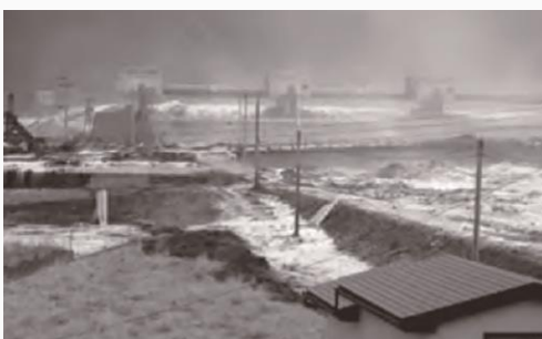
The waters overflowed the gates

There were no breaches of the water gates at the Omoto River, however the tsunami went over the breakwaters resulting in 117 buildings destroyed and flooding up to around 11m high.