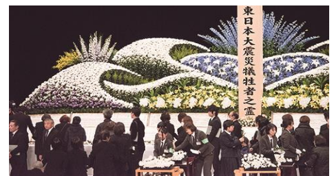
Attendees in line to offer prayers

At the end of the ceremony, attendees lined up to place white chrysanthemums (often used for funerals as a symbol of death) on the altar as they offered prayers to the victims while students from the Aoyama Gakuin Women's Jr. College sang a song of tribute in the background. It was a day for us to reflect on the disaster and strengthen our resolve towards making a complete recovery.