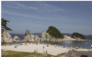
Jodogahama, Sanriku's most famous sight

Miyako Jodogahama Cruises resumed service on March 10 (Sat), after being suspended for hull maintenance and checks. The Jodogahama course is a 40-minute cruise past national natural monuments and coastal scenery. After departing from Jodogahama, one of Japan's prettiest spots, passengers can view Candle Rock, Husband & Wife Rock, Blowhole Rock, and more. On the boat, you can also have fun feeding the seagulls.