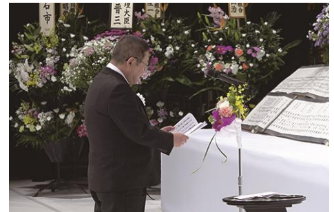
Miyako City Mayor Yamamoto makes a promise for the future