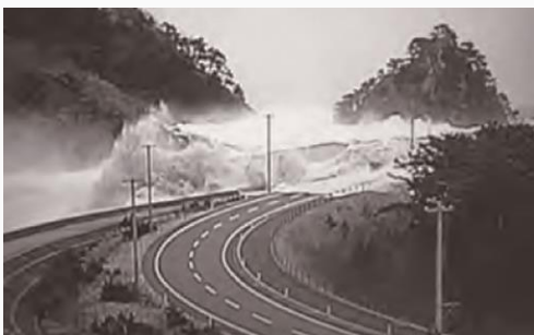
The tsunami reaches National Highway 45

What happened that day? In this section, we will be looking back at the disaster in each coastal town.