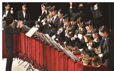
Handbell performance by the Aoyama Gakuin Women's Jr. College