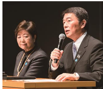
Talk session between Tokyo Governor Koike and Miyagi Prefecture Governor Murai

At the event space, booths were set up to sell local products and food. Each of the four prefectures worked to promote their region's path to reconstruction to the people of the greater Tokyo area.