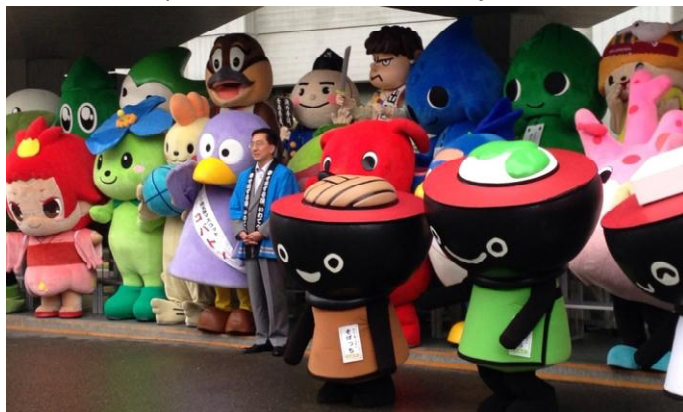
Governor Tasso with local mascots from around the country

This event is part of the "Smile 130 Project", which has