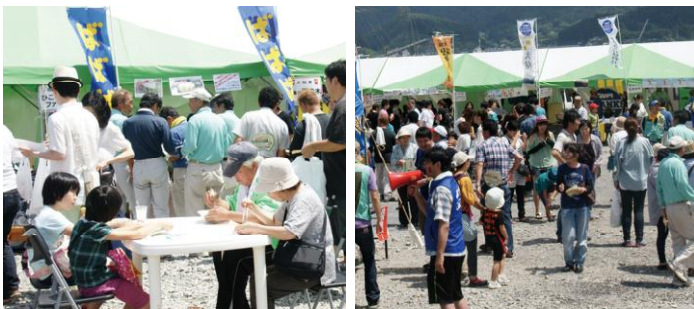
The Gourmet Festival

The event saw some 25 food retailers selling their goods. Centering around disaster-affected businesses in temporary shops, also represented were shops from (within Iwate) Rikuzentakata City, Sumita Town, Kamaishi City and Otsuchi Town, and (from outside Iwate) Noshiro City in Akita, Sagami City in Kanagawa, Tokamachi City in Niigata and Rubeshibe Town in Hokkaido. Visitors were able to enjoy delicious foods from all over Japan.