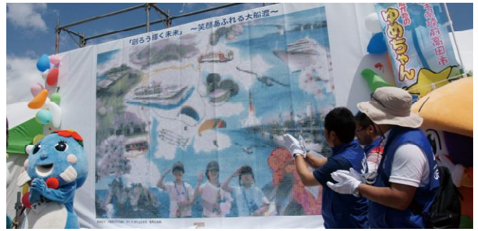
The "Image of the Future of the Reconstruction"