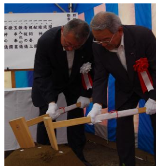
The Prayer Ceremony

The roads will be important as evacuation routes in case of future disasters, and in order to maintain the local community.