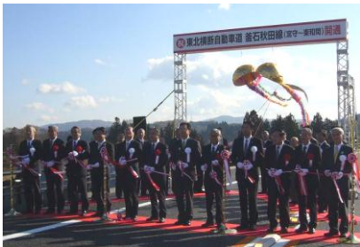
11/25 Opening Ceremony for the Trans-Tohoku Expressway (Miyamori-Towa Section)