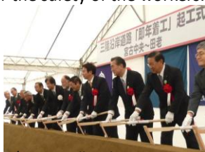
11/18 Groundbreaking Ceremony for construction of Sanriku Coast Road (Miyako-Taro Section)

November 18 saw the Groundbreaking Ceremony for the Sanriku Coast Road (Miyako Central-Taro Section). Work was expected to take 4 years after its initial proposal, but thankfully it was started within a year. Construction on the Sanriku Coast Road, which was only proposed after the disaster, has now truly begun. November 8's ceremony included breaking-in the shovels for the project, and praying for the project's speedy conclusion and for the safety of the workers.