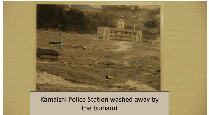
Kamaishi Police Station washed away by the tsunami