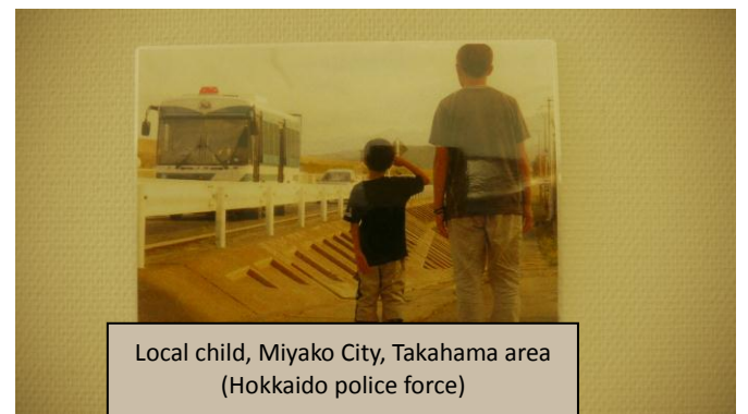
Local child, Miyako City, Takahama area (Hokkaido police force)