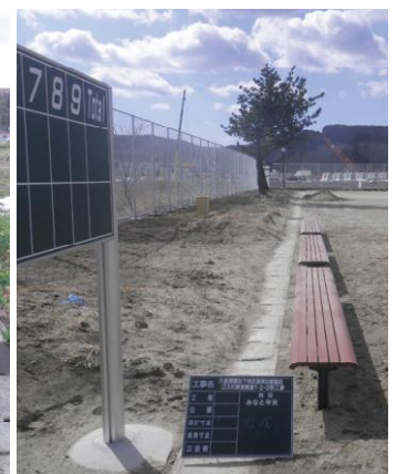
After restoration work

We are recruiting members for the Iwate Reconstruction Supporters Team!