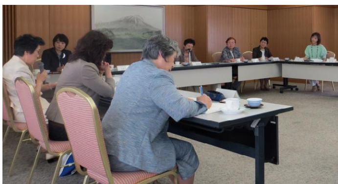
The opinion exchange meeting

This opinion exchange brought together 13 women who are working in various fields within Iwate Prefecture. It is the third time the meeting has been held, following previous meetings in July 2011 and June 2012.