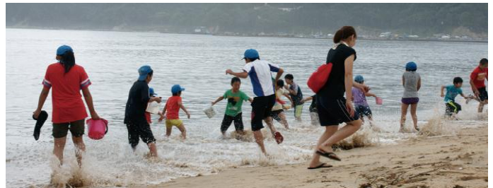
Children playing in the waves

a time limit of 3 hours they made sculptures of things like dinosaurs, boats and the local traditional tiger dance.