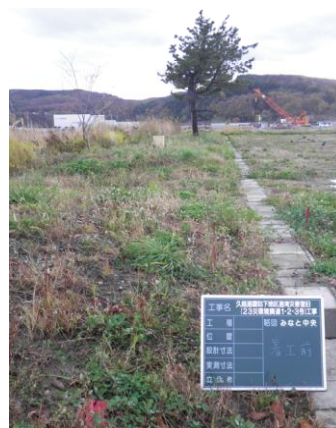
Before restoration work

Kuji City has become a focal point of attention as the site of the popular NHK morning drama Ama-chan . Here as well, the reconstruction can be seen moving forward.