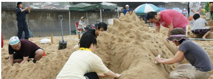
A dinosaur made out of sand

Around 130 people both from within Otsuchi and elsewhere gathered at the event. They broke up into teams, and with