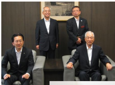
(Left) Yamato Holdings, Co. Ltd