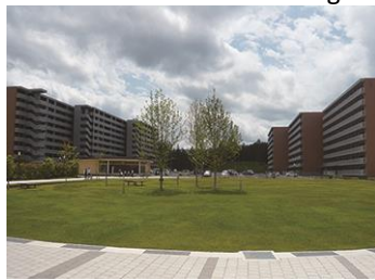
The newly-opened Tochigasawa Apartments

Applications will continue to be accepted until the apartments are filled. It's possible to apply as a group to be placed closely together.