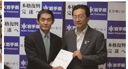
Governor Tasso submits his proposals and requests