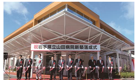
Yamada Hospital's reopening ceremony

Rikuzentakata City is due to finish next year.