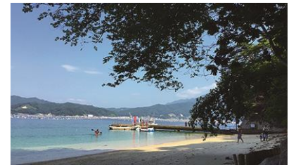
The beach on Holland Island

Tours of Holland Island will continue until October.