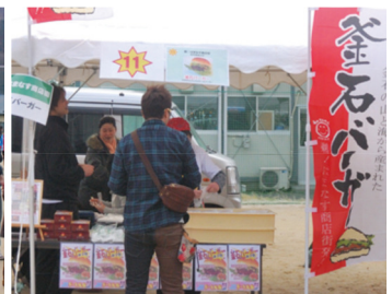
The Kamaishi Burger booth that won first place

Many young people are diligently helping the affected area of Sanriku move toward a full reconstruction. The section "People for Sanriku's Future" introduces these young people and their powerful dedication.