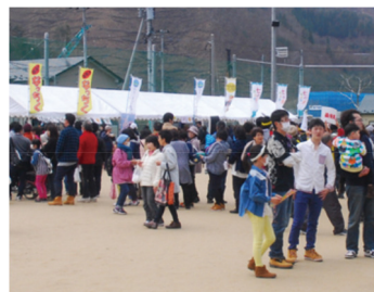
Recovery Gourmet Grand Prix in Otsuchi

This event began in 2013 to publicize the current state of the disaster-affected areas through dishes cooked up using local ingredients along the Sanriku Coast. There were 13 shops that participated this year, and they each sold one original dish for 300 yen. U-no! Hanamasu Shoutengai's Kamaishi Burger was voted as the winner this year.