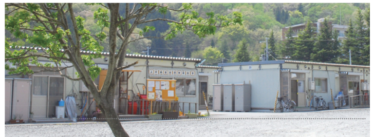
Renovation planned for Kaminakashima Temporary Homes (Kamaishi)

There are additional plans to renovate roughly 9,200-9,500 temporary units that might continue to be inhabited after 2017. Renovation on these units will occur in the 2 years from 2015 to 2016.