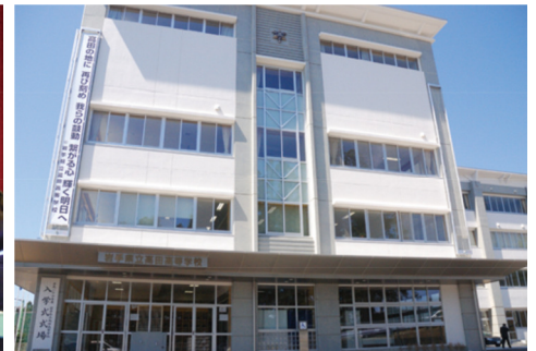
The newly rebuilt Takata High School building