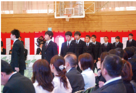
Incoming freshmen entering the opening ceremony