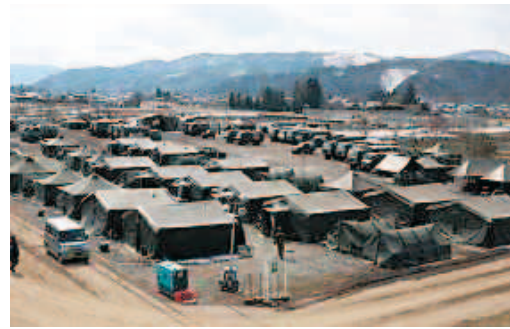
Ground Self-Defense Forces, which joined in the rescue operations, were based in the Tono Sports Park

Rescue forces, including the Self-Defense Forces and emergency fire rescue forces, gathered in the logistic support bases established in Tono immediately after the disaster. Rescue activities in the coastal areas affected by the disaster were launched from these bases, including Tono Sports Park.