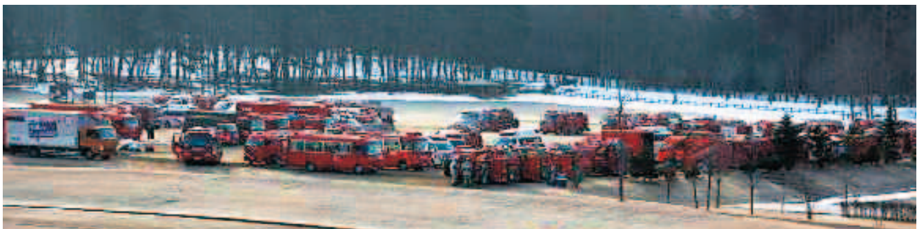
Osaka Emergency Fire Rescue Team gathered in Tono Sports Park

Rescue forces, including the Self-Defense Forces and emergency fire rescue forces, gathered in the logistic support bases established in Tono immediately after the disaster. Rescue activities in the coastal areas affected by the disaster were launched from these bases, including Tono Sports Park.