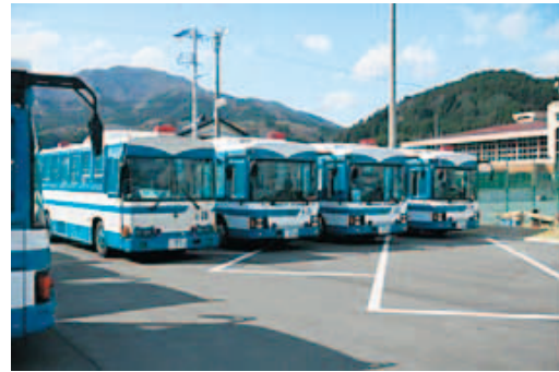
A widespread emergency assistance police team gathered in Sumita's facilities