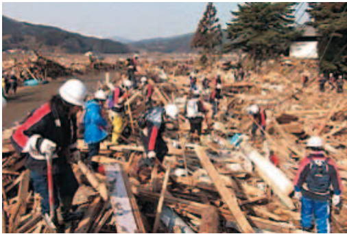
Sumita fire brigade performing search activities for missing people

In addition, as for the unique effort of the inland town of Sumita, besides providing relief goods, the fire brigade performed search activities and made meals to supply the soup kitchen. They also accepted support staff, such as those in the police force, into the town facilities to help with support activities in the adjacent Ofunato and Rikuzentakata cities.