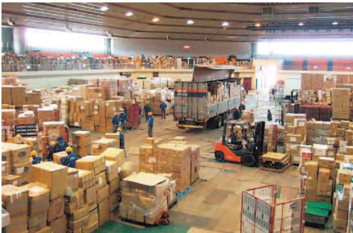
Storing operation of relief goods in Iwate Industry Cultural Center (aka Apio), which worked as the integrated supplies office

This relief goods logistics system run by the cooperative efforts of prefectures and trucking associations was later called the "Iwate method", and became a model case for Japan.