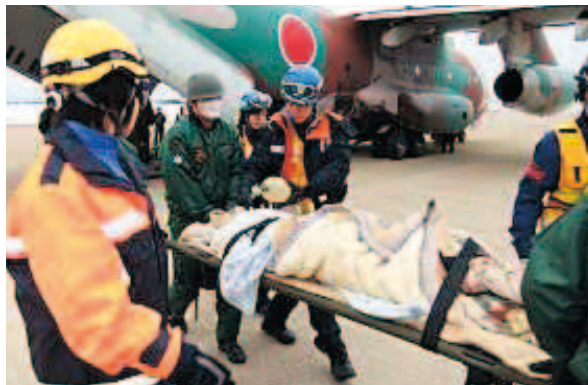
The DMAT performing widespread medical transport to the medical institutions outside the prefecture by a transporting aircraft from the Self-Defense Forces (Hanamaki Airport)