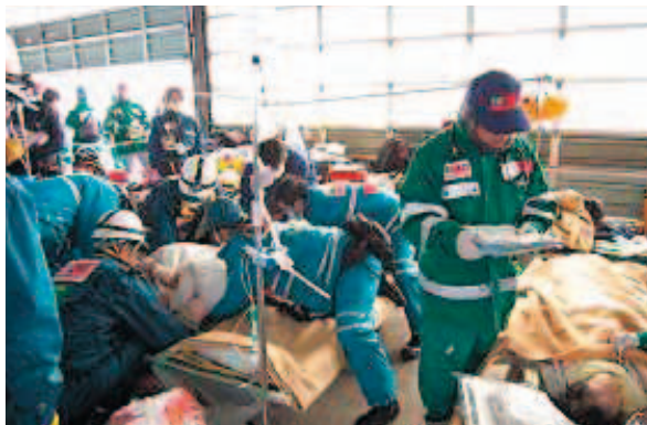
The DMAT performing triage and emergency treatment on patients transferred by SCU (Hanamaki Airport)

The DMAT activity was Japan's first undertaking of widespread medical transportation outside of the prefecture at the SCU base, and became a model for SCU operations.