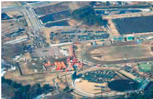
Rescue forces gathered in Tono Sports Park (sky photo)

As an inland city, Tono City quickly created logistical support bases to support the coastal municipalities whose administrative functions had been paralyzed by the tsunami; the city also undertook systematic preparations to support the disaster-affected areas.