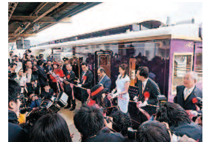
Ceremony for the resumption of all the lines on the South Rias Line (April 5, 2014)

Three years after the disaster, all the lines opened up again and they had been used as a tourism resource (such as an event train). They are established as a precious, invaluable asset in the local area.