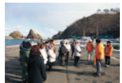
Skills training of the earthquake storytellers organizations (local training)

In order to make educational trips the pillar of tourism in coastal areas focusing on earthquake studies, Iwate Prefecture has been working to improve our level of knowledge, start up a network of earthquake storyteller associations, and to build the platform for undertaking centralized information distribution of all the information about the disaster-affected areas.