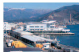
Fish market after improved sanitation (Ofunato fish market)

Through utilization of the rich aquatic resources of Sanriku, by helping 80% of the marine product processing industries affected by the disaster to recover and improving the additional value of the harvested seafood in the region, efforts were made to revive the local aquaculture industry as a key industry.