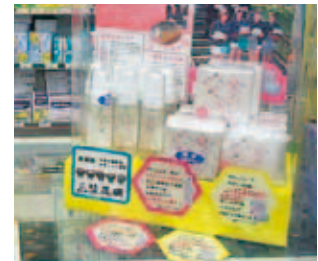
Due to matching, the market for cosmetics produced in the prefecture has expanded throughout the country

From past matching, there are also cases of increasing the use of products from the prefecture such as utilization support of the companies' own sales channels, implementation of internal sales events, making menus for employees' canteens, and so on.